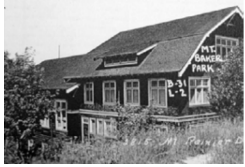
Mount Baker Community Club